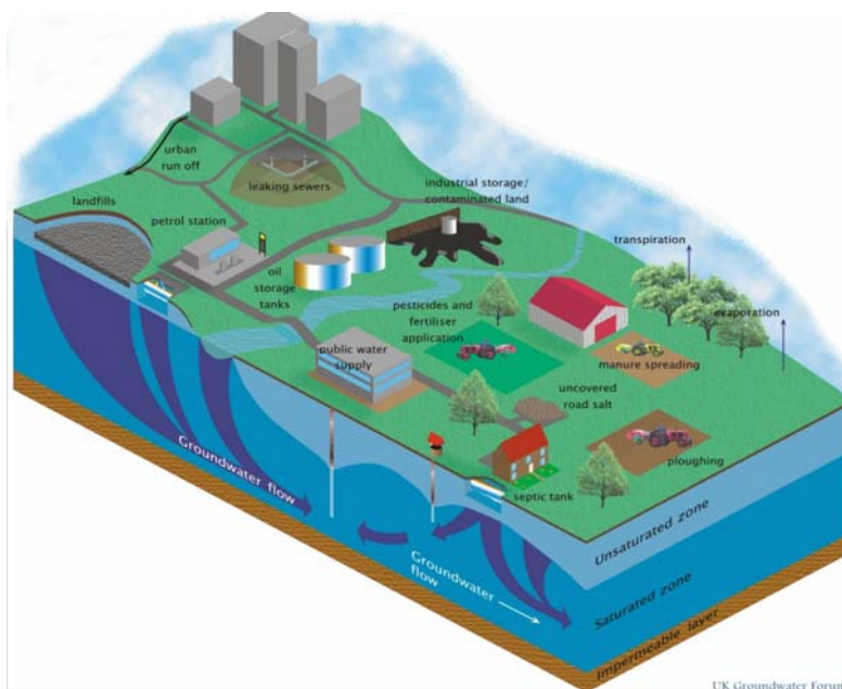
Figure 2: Threats to Groundwater

A1.2.1 Both point source pollution (e.g. from septic tank effluent, spillages or leaks, landfill leachate, etc.) and diffuse pollution (e.g. from application of organic or inorganic fertilisers or pesticides to land) are a threat to groundwater quality. Historically, most of the identified contamination problems have been associated with point source pollution. More recently it has been increasingly recognised that diffuse sources cause significant pollution of groundwater.