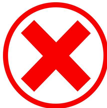
Figure 1- Deposit of waste onto waterlogged land is not permitted under the terms of an exempt activity.