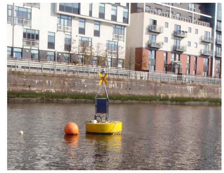
Figure 1: ICE buoy surface deployment

Inputs into the Clyde estuary from point discharges are quantified by the measurement of biochemical oxygen demand or BOD. Inputs of organic waste have declined over the years thanks to improvements in effluent treatment brought about by improved environmental legislation and investment by Scottish Water. The buoy in the upper Clyde continues to monitor these improvements to the water quality of the Clyde estuary.