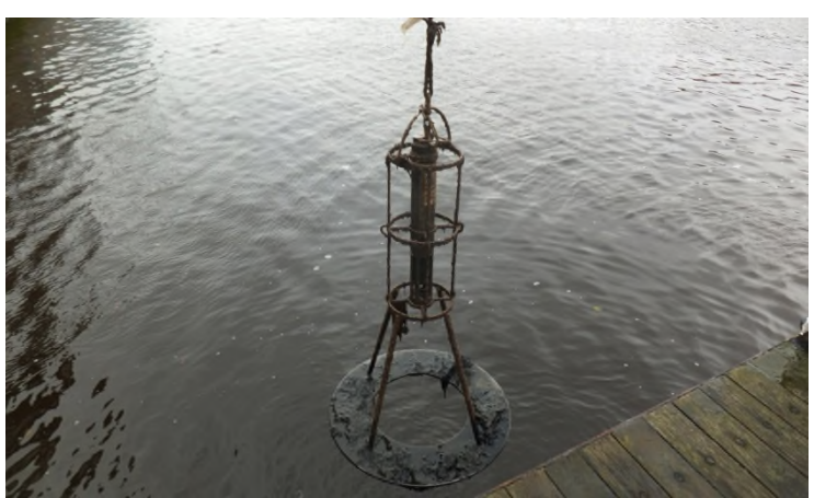
Figure 2: ICE buoy river bed deployment.

Low dissolved oxygen concentrations are known to occur in the upper Clyde estuary especially during the warmer summer months. Oxygen is less soluble at higher temperatures and is also consumed by the microbial breakdown of organic matter from waste water discharges, urban diffuse pollution and organic matter retained in the sediment.