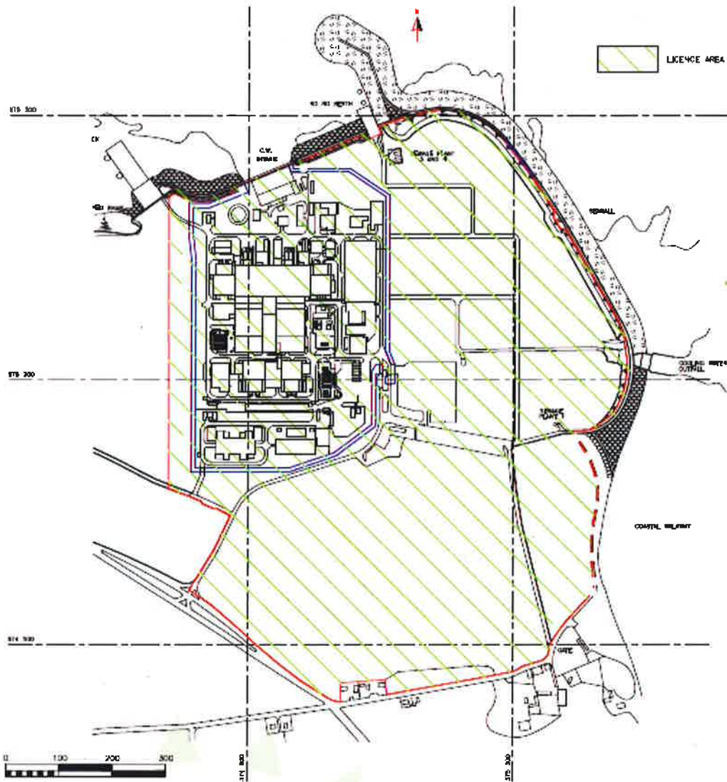
LAYOUT OF TORNESS POWER STATION LICENSED SITE AREA