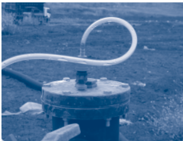
Figure 5.5 | Condensate in connection tubing during sampling