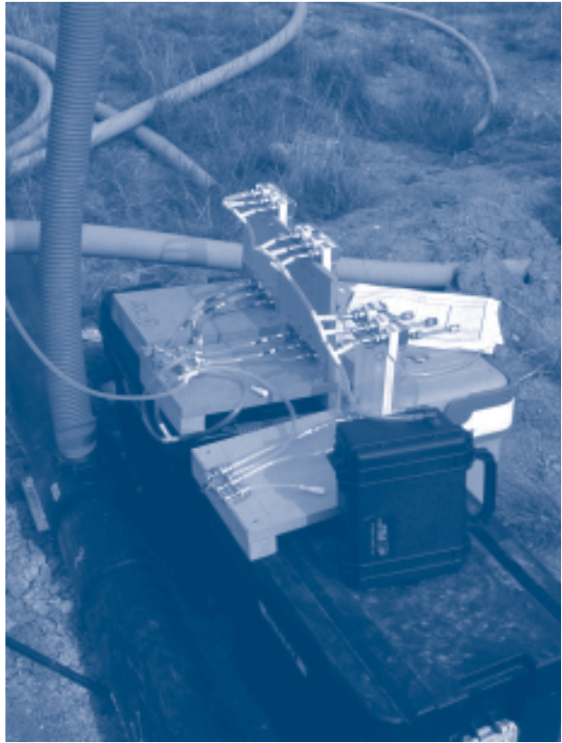
Figure 5.3 | Sampling tubes and rotameter assemblies