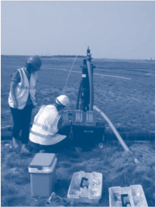
Figure 5.2 | On-site sampling system connected to a landfill gas well