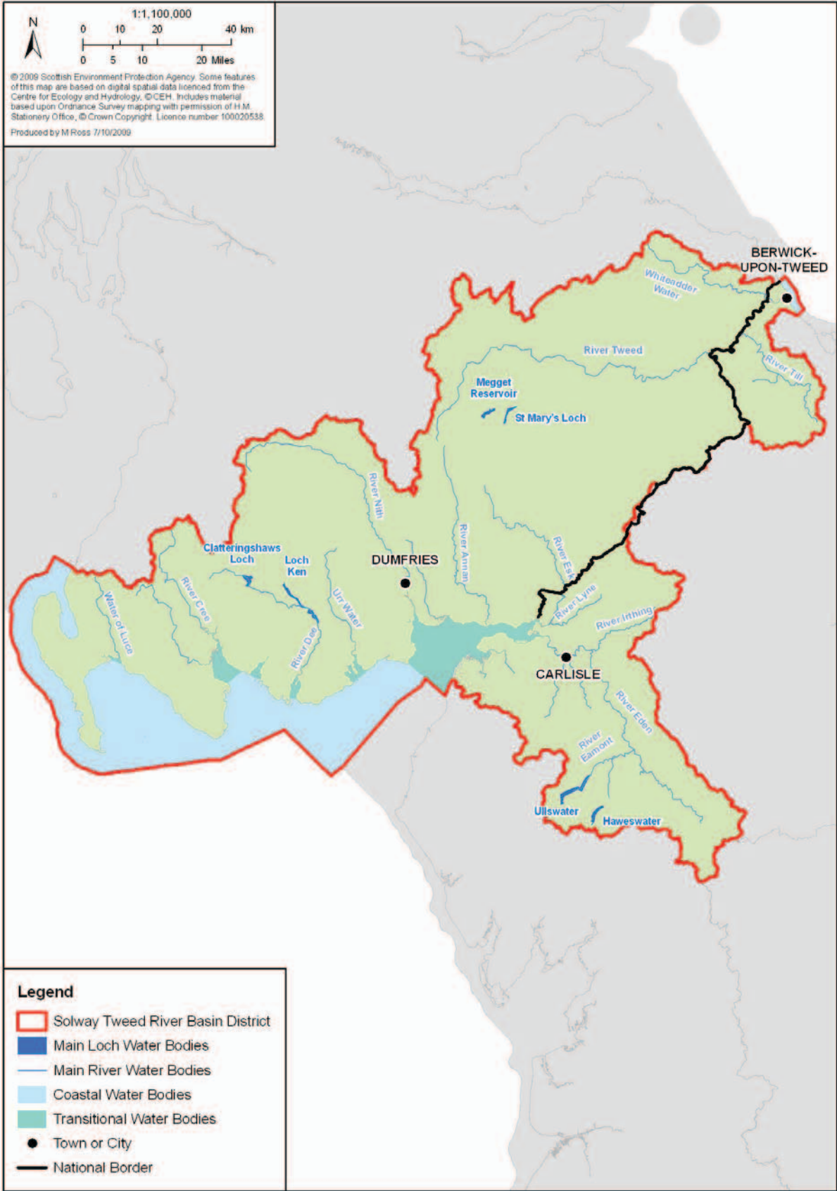
Figure 1: Map of Solway Tweed RBD