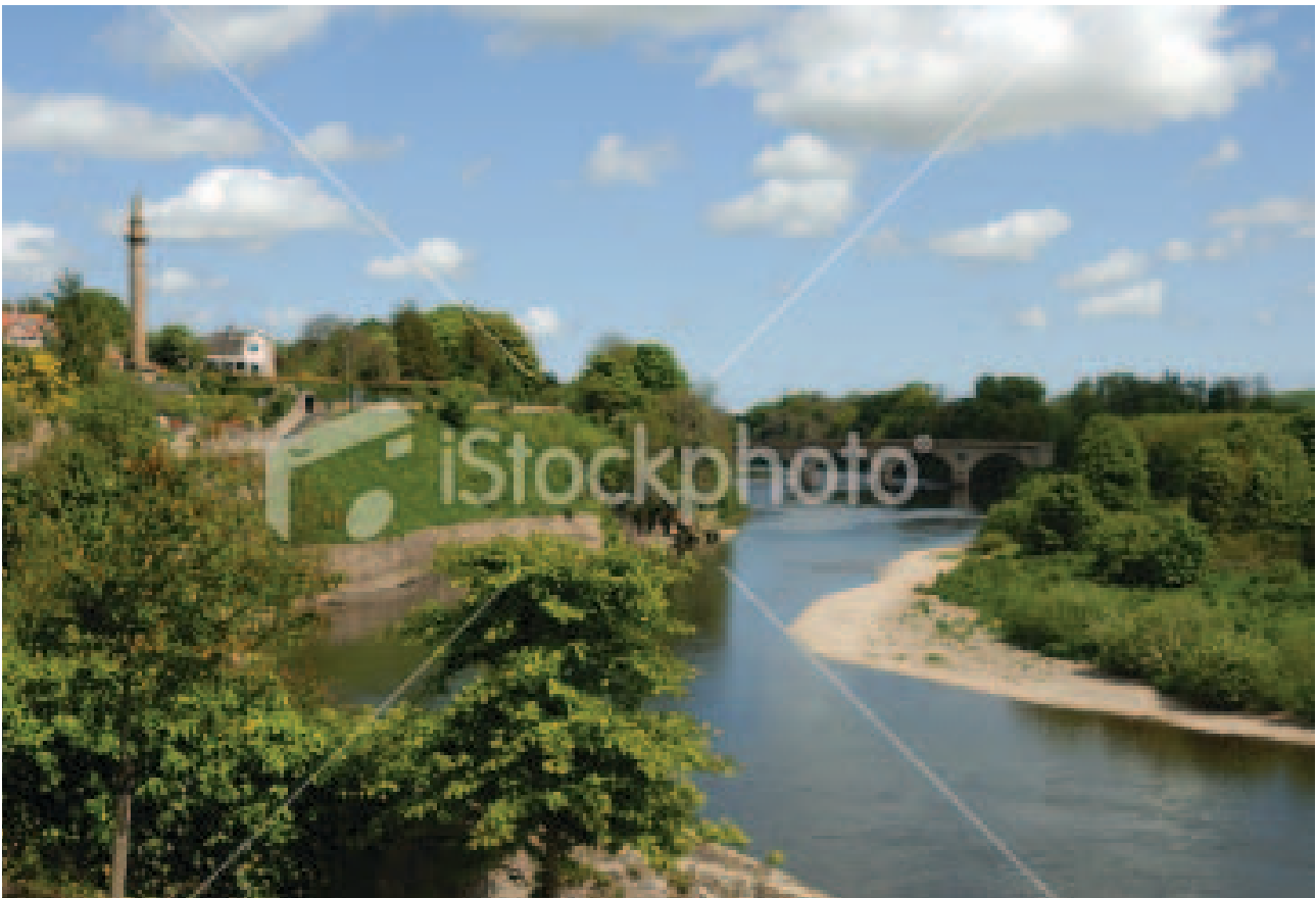
River Tweed, Coldstream

Your comments will be used to shape how the updated river basin plan will be developed. A summary of consultation responses will be published by June 2013 explaining how your input has been used to influence the river basin planning process. It will be distributed to those who have submitted comments as well as being published on SEPA's website, with links from the Environment Agency's website.