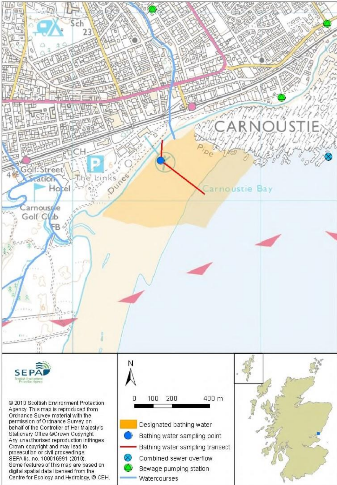
Map 1: Carnoustie bathing water