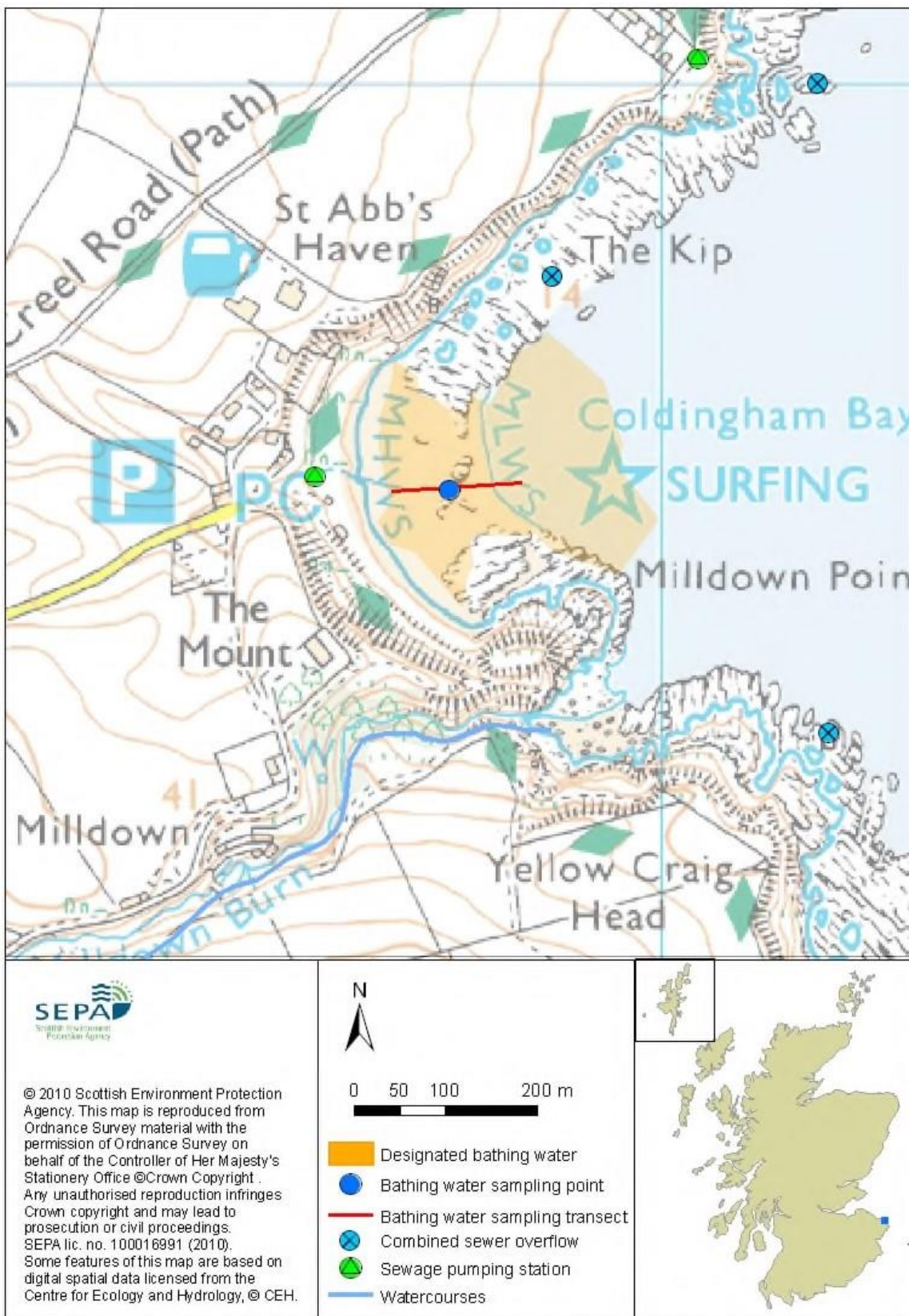
Map 1: Coldingham bathing water