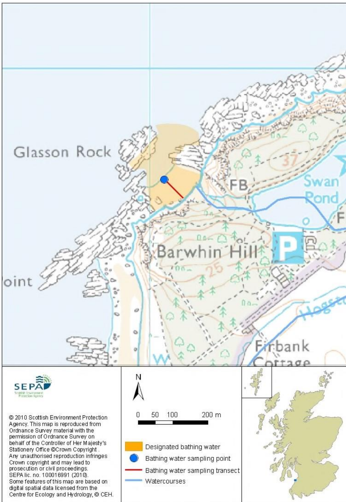
Map 1: Culzean bathing water