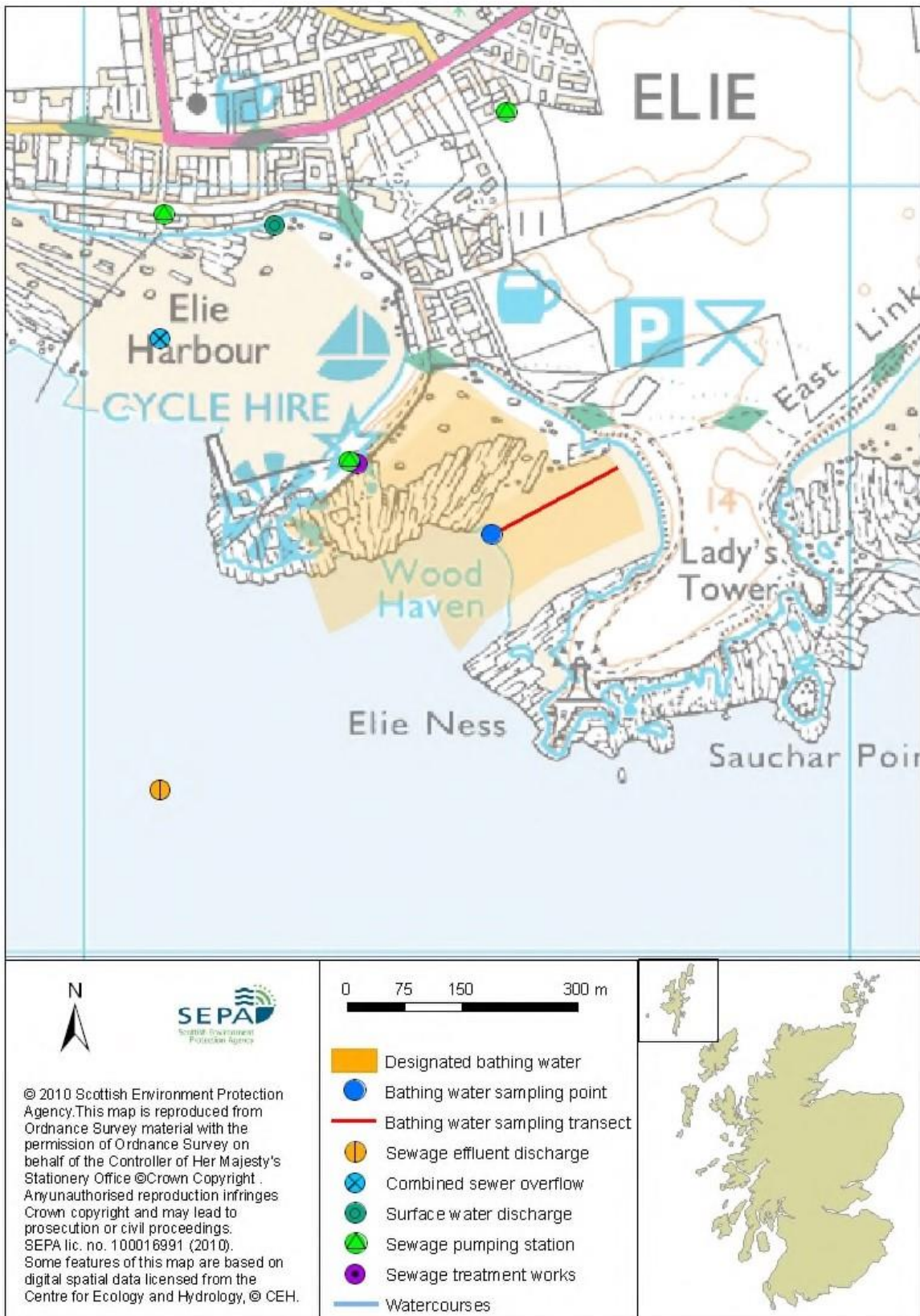
Map 1: Elie (Ruby Bay) bathing water