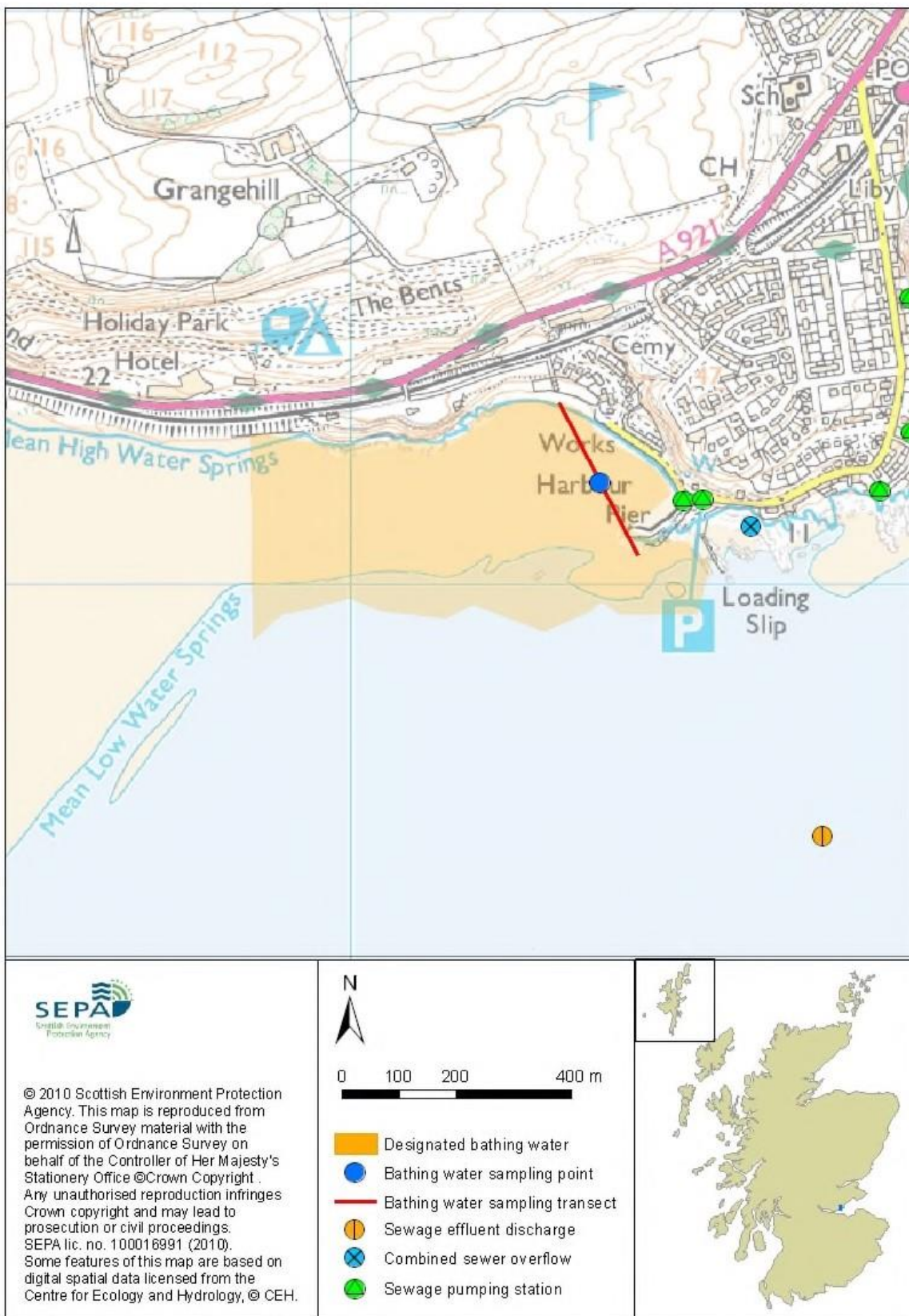
Map 1: Kinghorn (Pettycur) bathing water