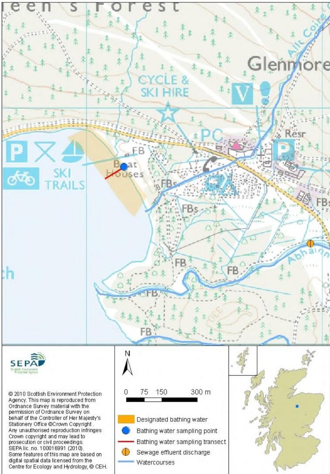
Map 1: Loch Morlich bathing water