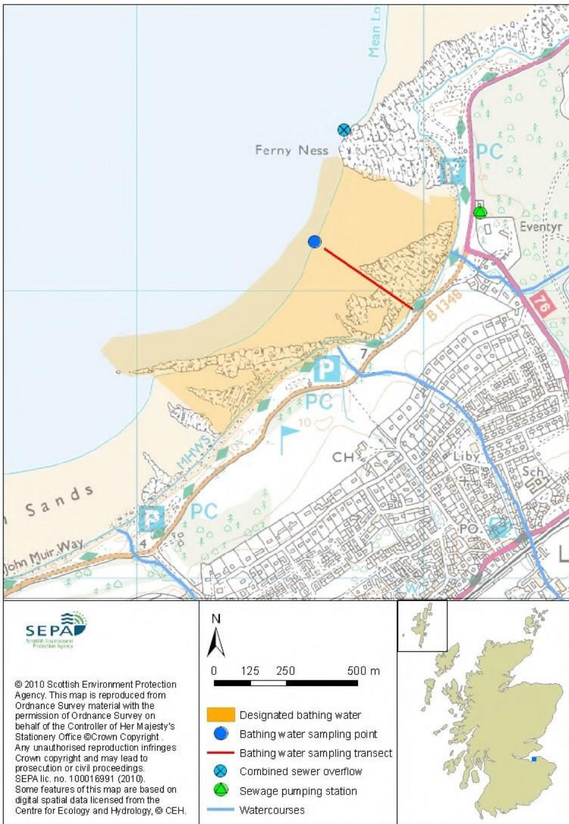
Map 1: Longniddry bathing water