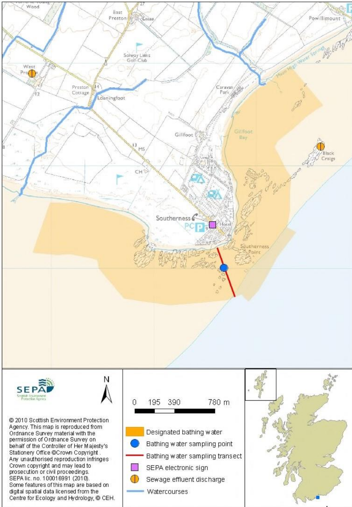
Map 1: Southernness bathing water