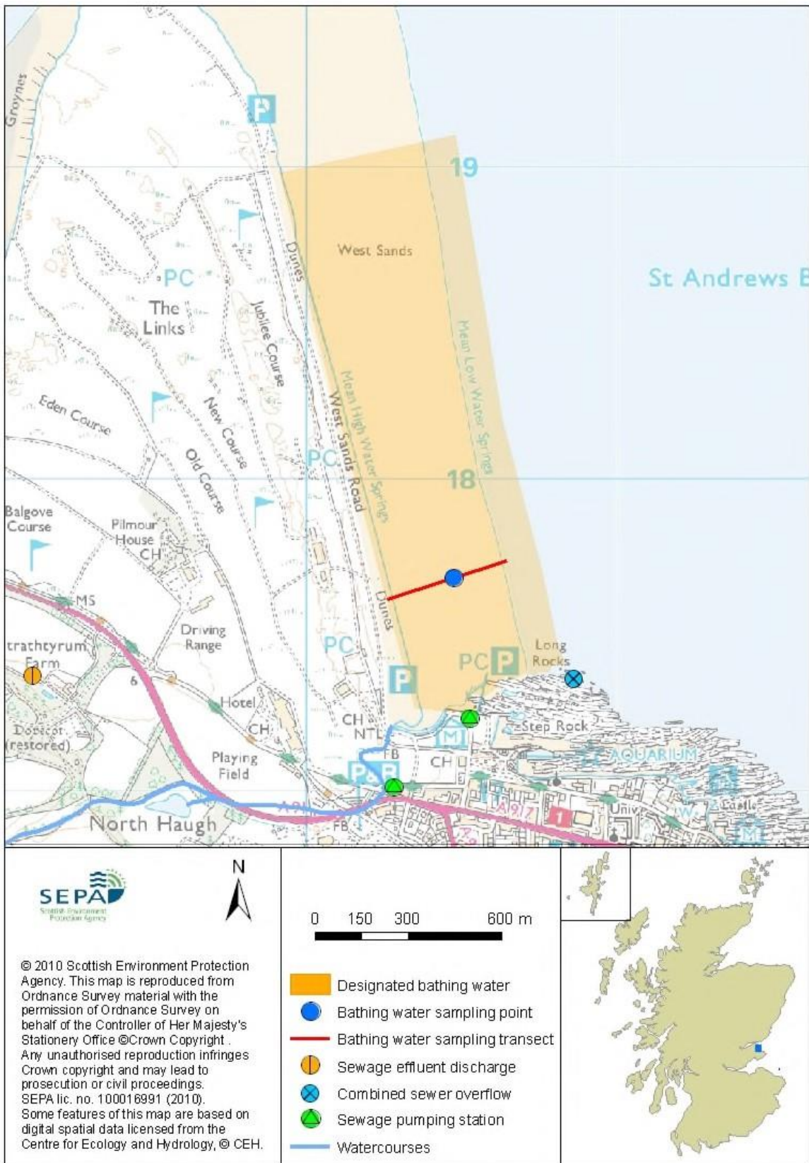
Map 1: St Andrews (West Sands) bathing water