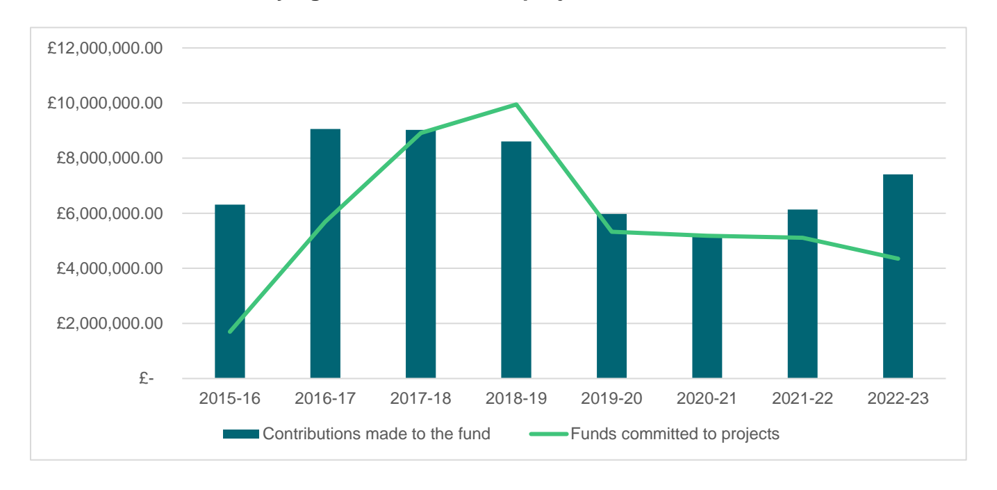
Chart 1: Value of Qualifying contributions and projects enrolled over time