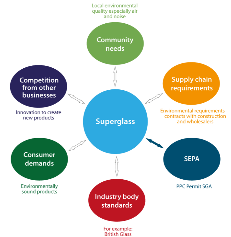
Figure 2. Business Influence Map - Superglass

Sustainable Growth Agreements are one way of helping achieve this, recognising that the most successful businesses in the 21st century are those that will see environmental and social success as an opportunity to create business success.