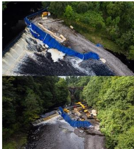
Image: September 2016 – Millheugh works (top) and Fernegair (bottom).

The partnership project between SEPA, the River and Fisheries Trusts of Scotland , Clyde River Foundation , Avon Angling Club and the landowners was funded by WEF (£1.2M).