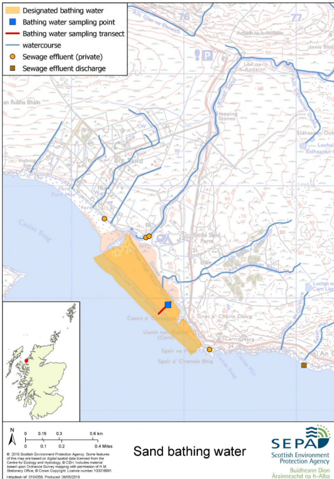
Map 1: Sand Beach bathing water