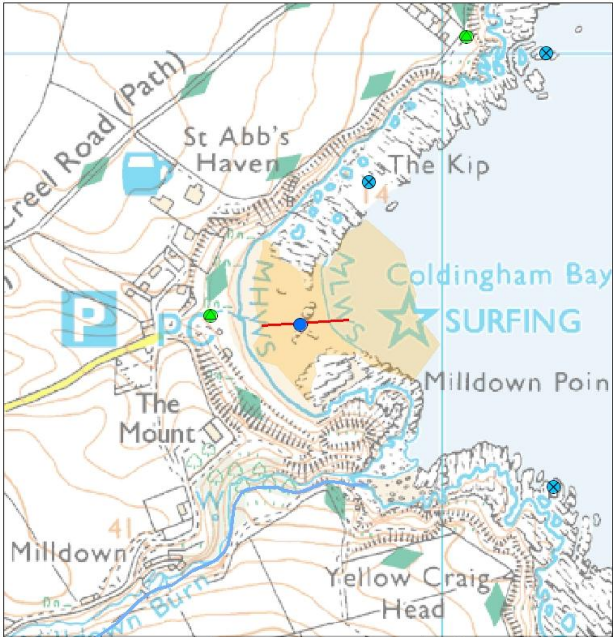
Map 1: Coldingham bathing water