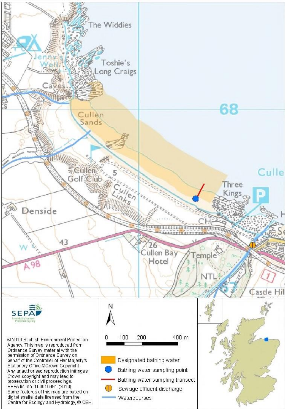
Map 1: Cullen Bay bathing water