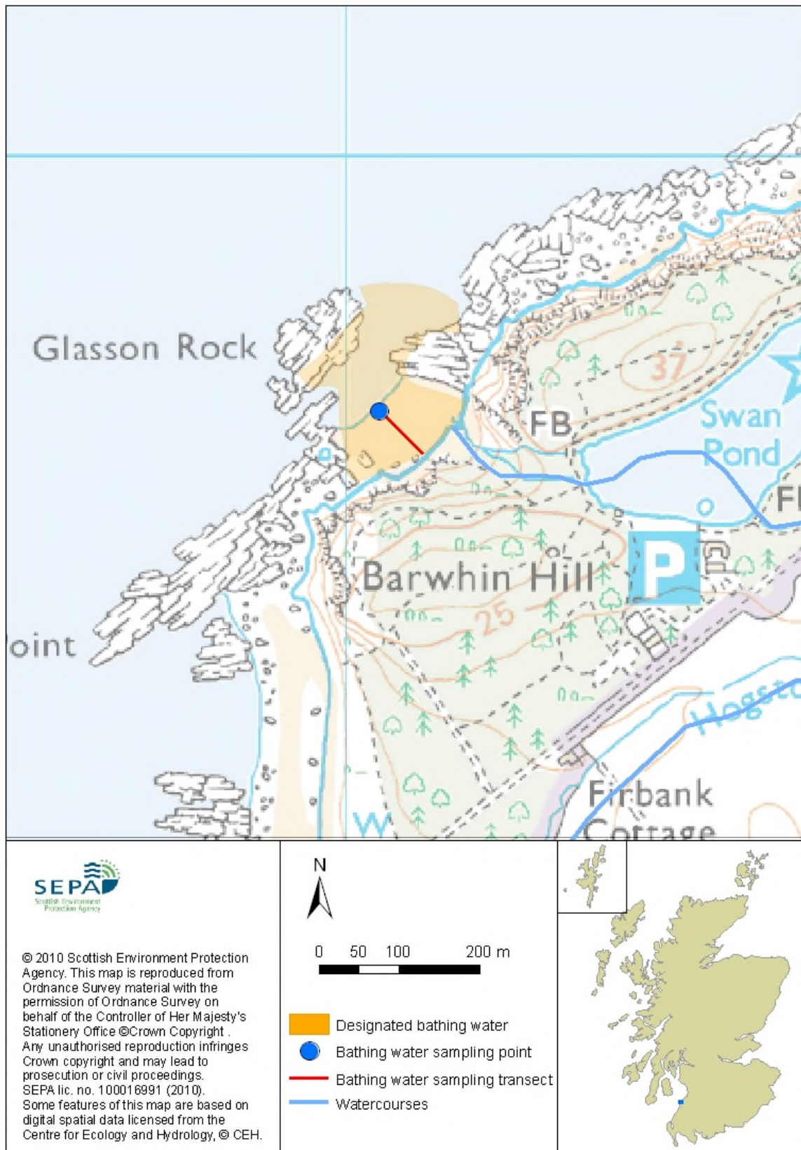
Map 1: Culzean bathing water