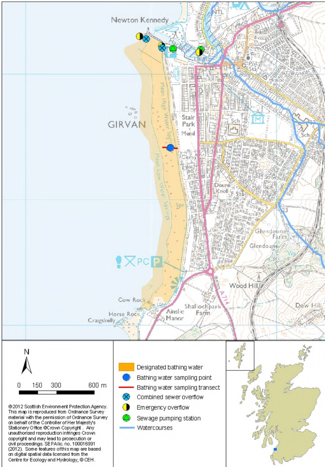
Map 1: Girvan bathing water