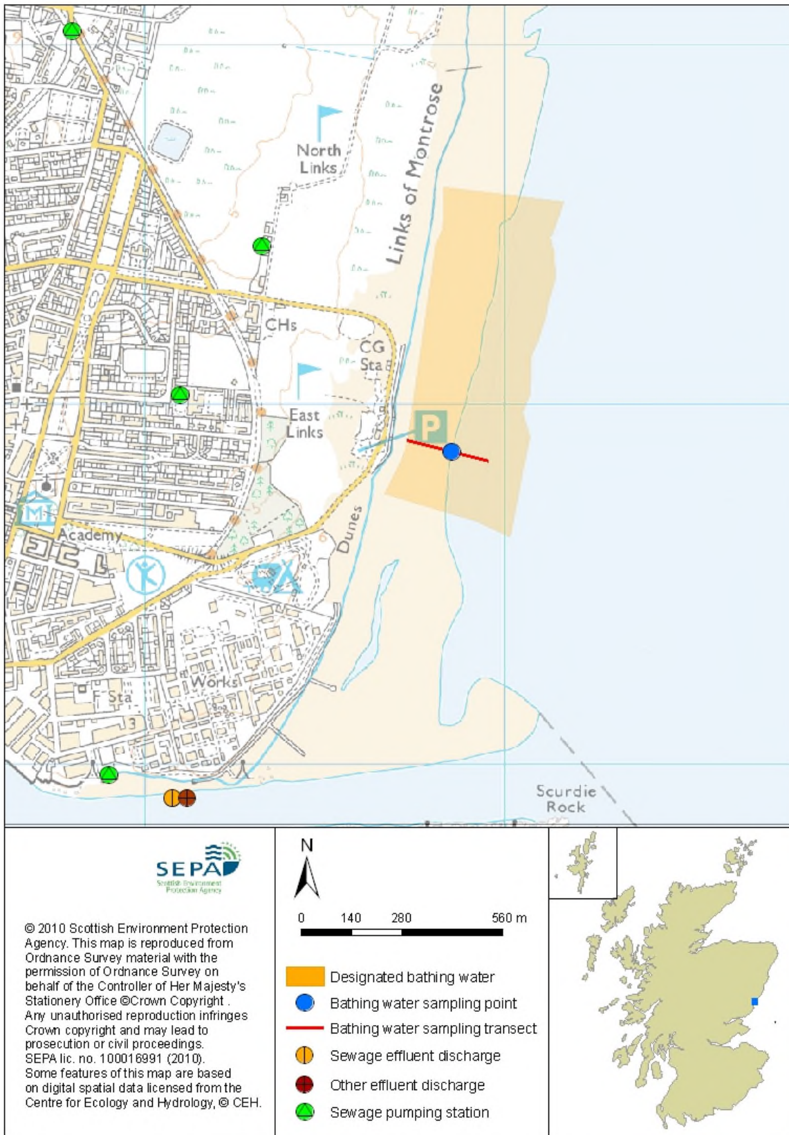
Map 1: Montrose bathing water