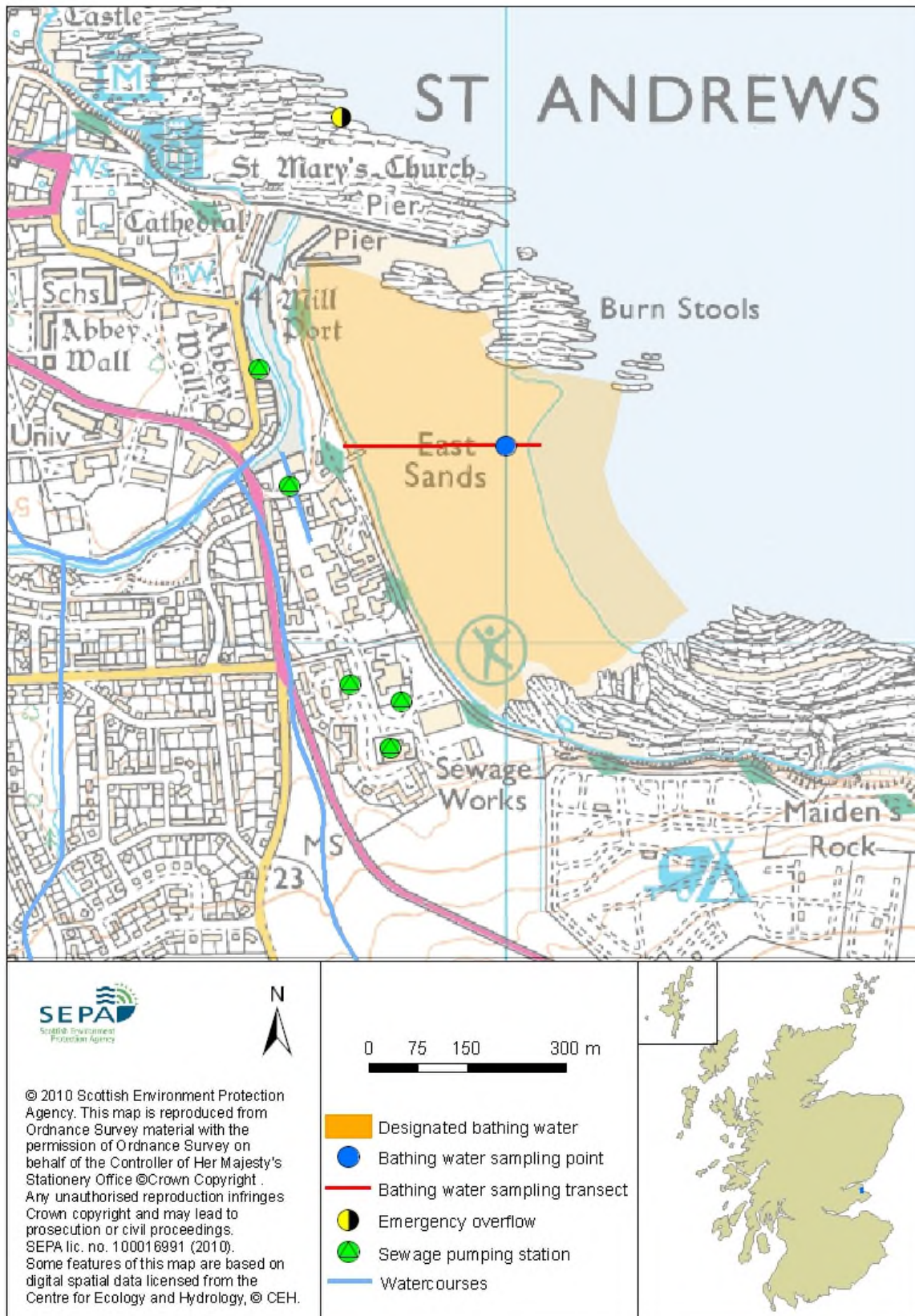
Map 1: St Andrews (East Sands) bathing water