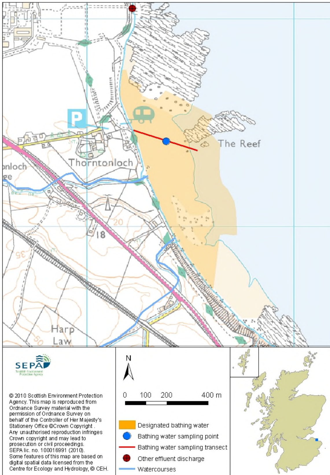
Map 1: Thorntonloch bathing water