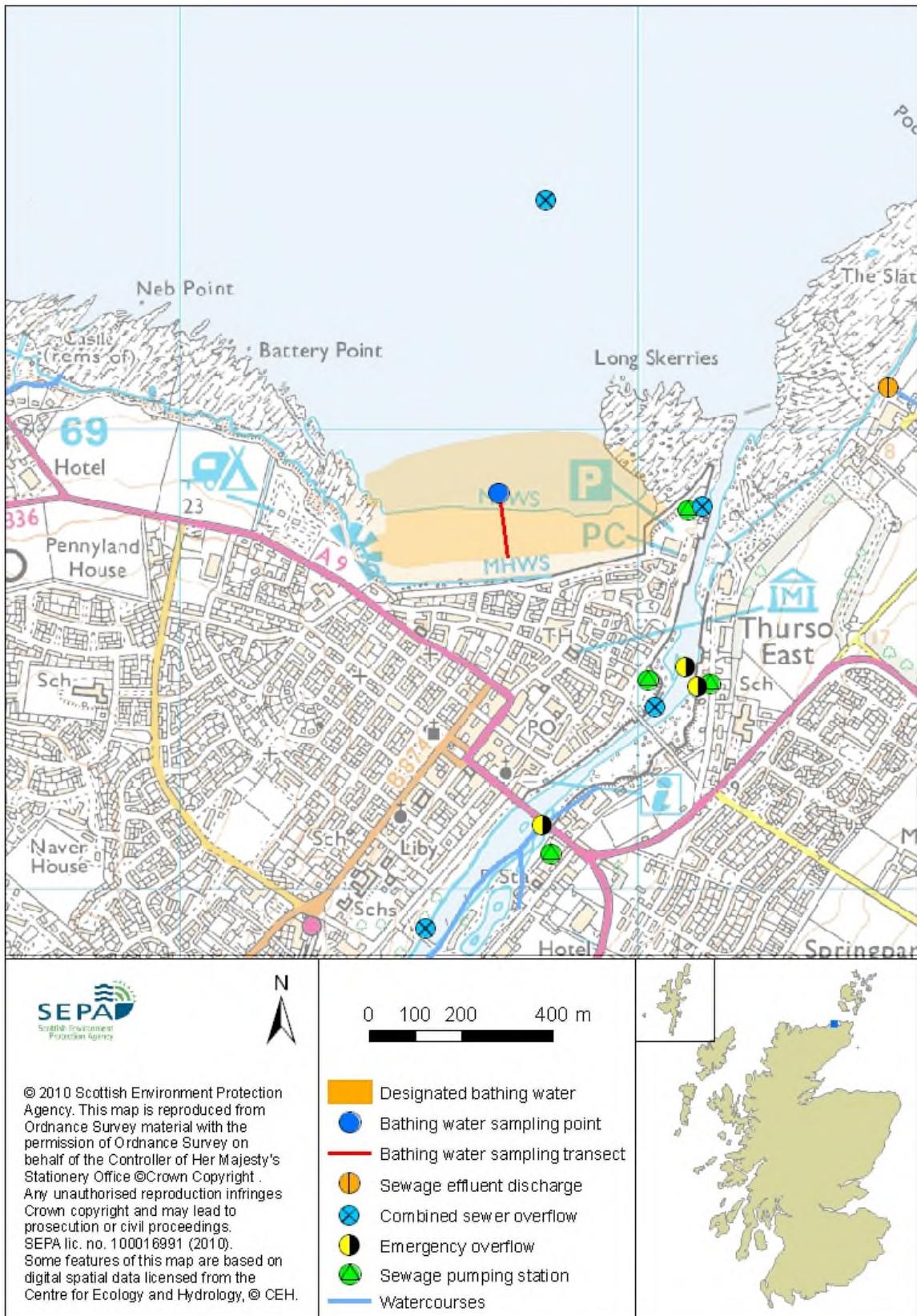
Map 1: Thurso Bay (Central) bathing water