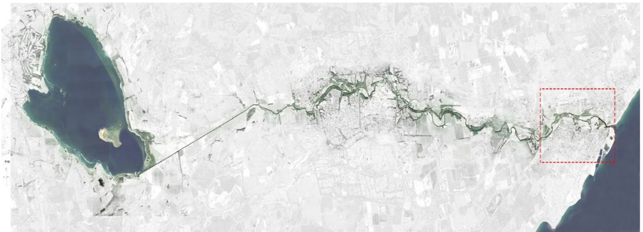
Figure 1: The River Leven catchment from Loch Leven to Levenmouth