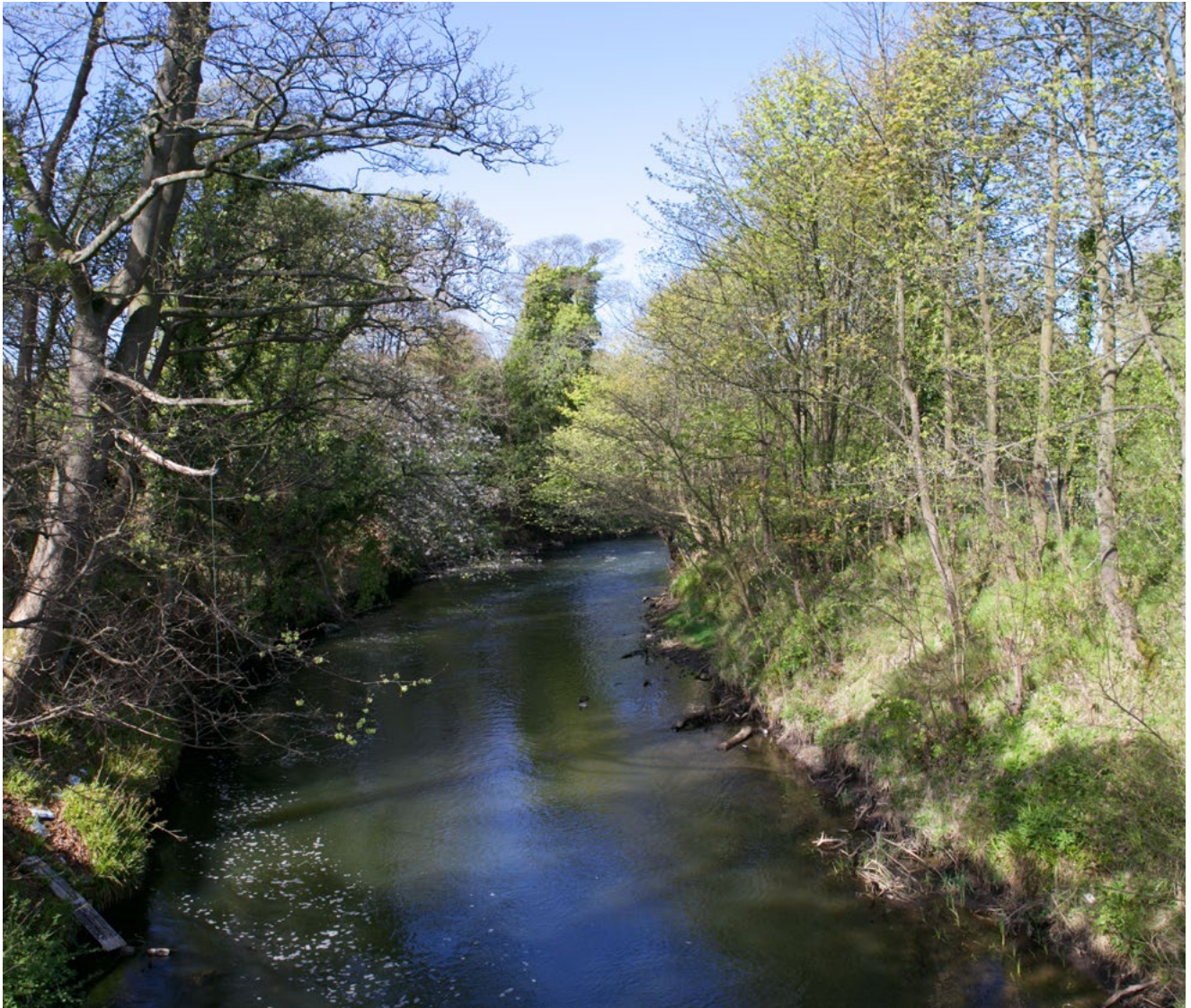
Figure 2: River Leven at former creosote works site at Methil Brae